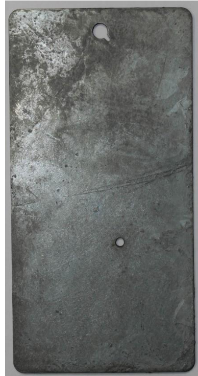
HDG – 12 months