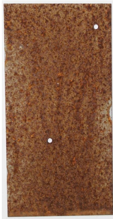
Mild steel – 12 months