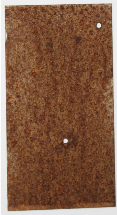
Mild steel – 12 months