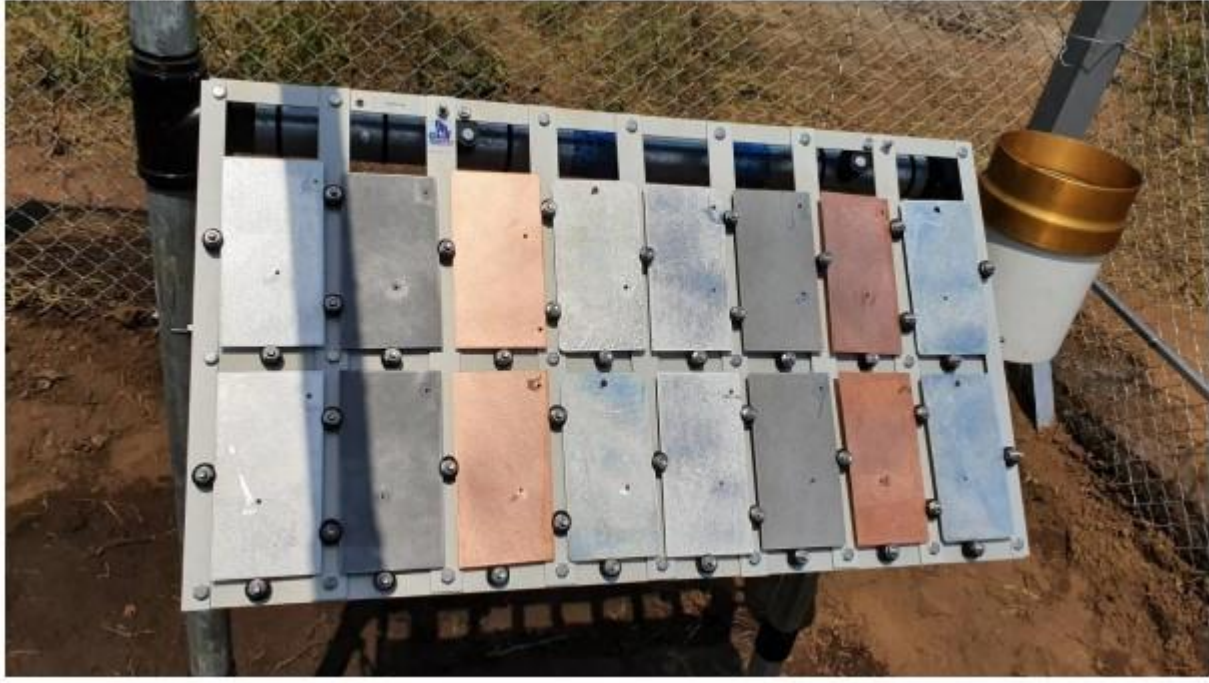
Wadelai Test Site.