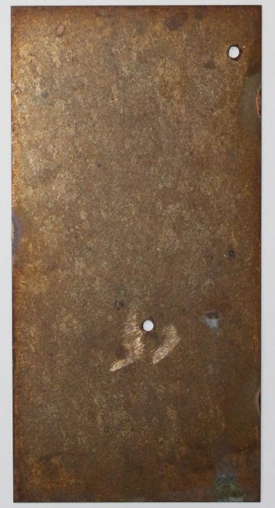
Copper – 12 months