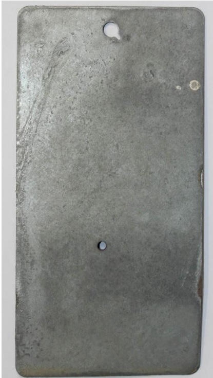
HDG – 12 months