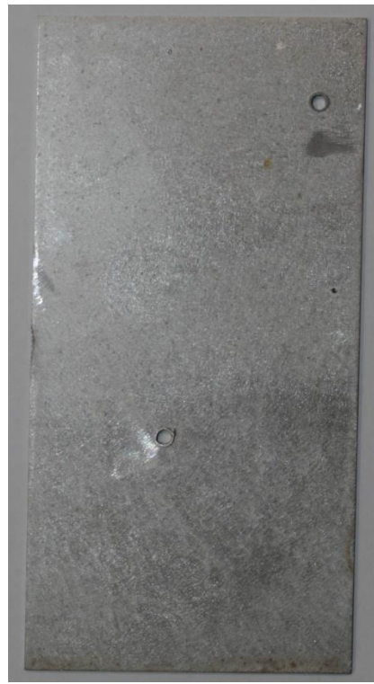
Aluminium – 12 months