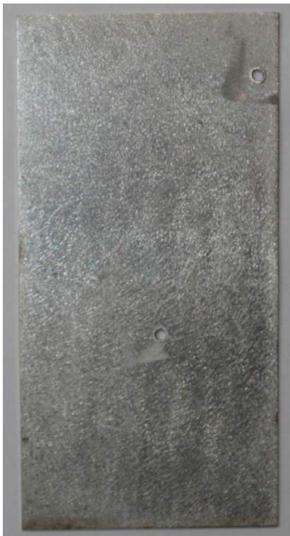
Aluminium – 12 months